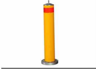
Manual Mushroom Barrier