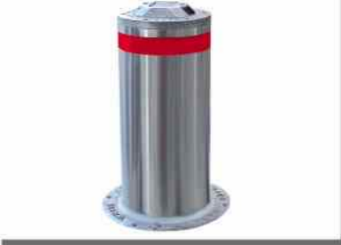
Hydraulic Stainless Mushroom Barrier