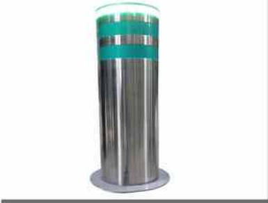
Mushroom Barrier with Led